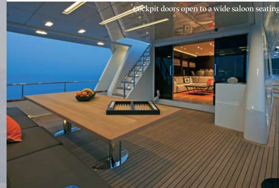
Cockpit doors open to a wide saloon seating

Bulkheads are of mahogany, darker than the deck with strong and dominant accents. The glass cupboard to starboard houses a large lifting flat-screen TV for family entertainment.