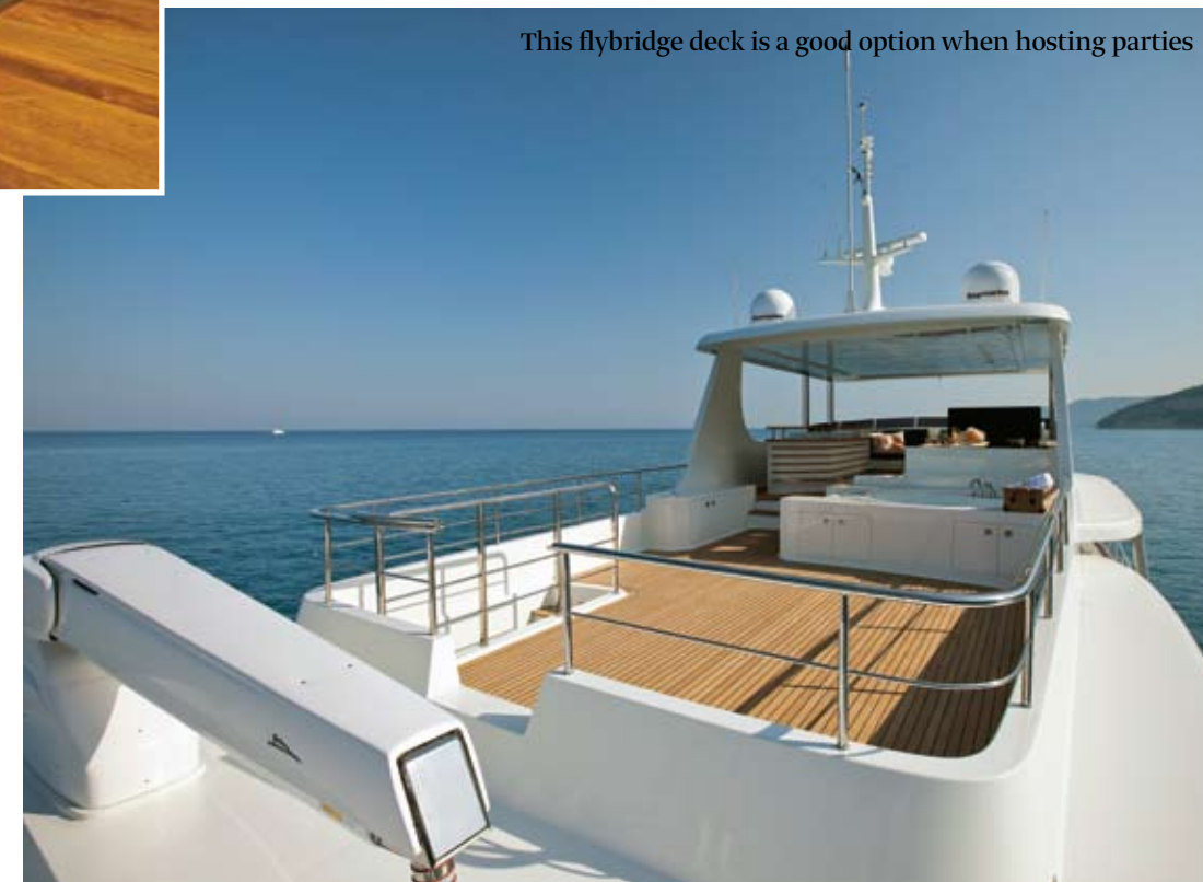
This flybridge deck is a good option when hosting parties

the sink giving it masses of storage. The twin cabins on the opposite side have a shared bathroom. The second cabin with bunks across the beam has a top bunk that folds away to make it single if desired. All in all, it's a very sensible arrangement in case it is given out as a charter yacht.