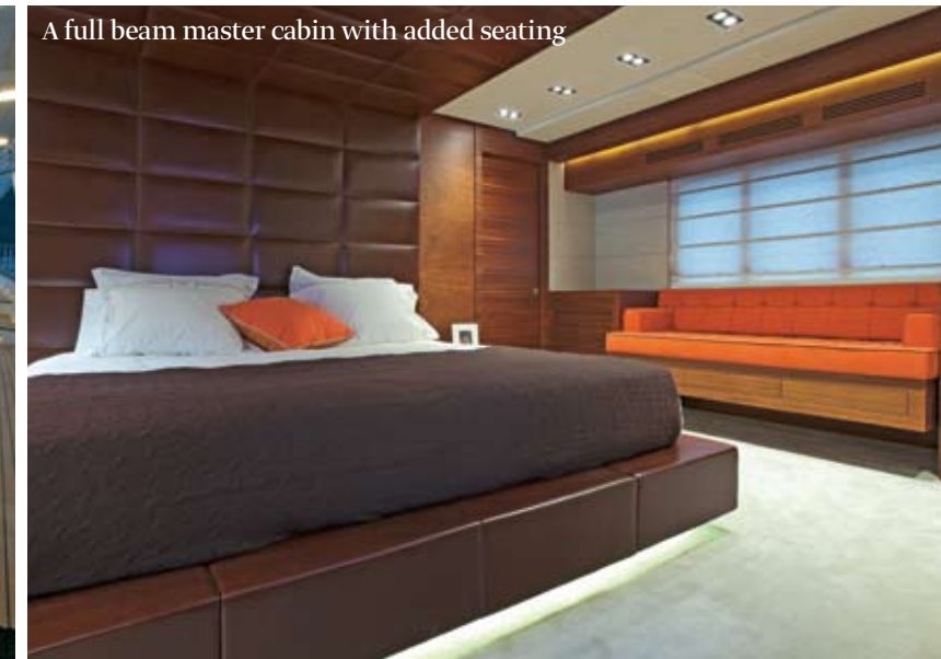
A full beam master cabin with added seating

Large side windows and light leather ceiling ensure the space is not dark or cave-like. The L-shaped sofa to port is finished in light mousse-coloured suede and allows flexible and comfortable seating arrangements for four to five people. Two low coffee tables on red patterned rugs and two higher side tables complete the picture. Amidships on the main saloon is the dining area where a walnut dining table seats eight comfortably and can be expanded in case 10 people wish to dine together. The bulkhead twist dining area and galley cleverly conceal a wine chiller and racked bottle storage, while a multimedia entertainment locker houses an Apple TV and a Sonos sound system.