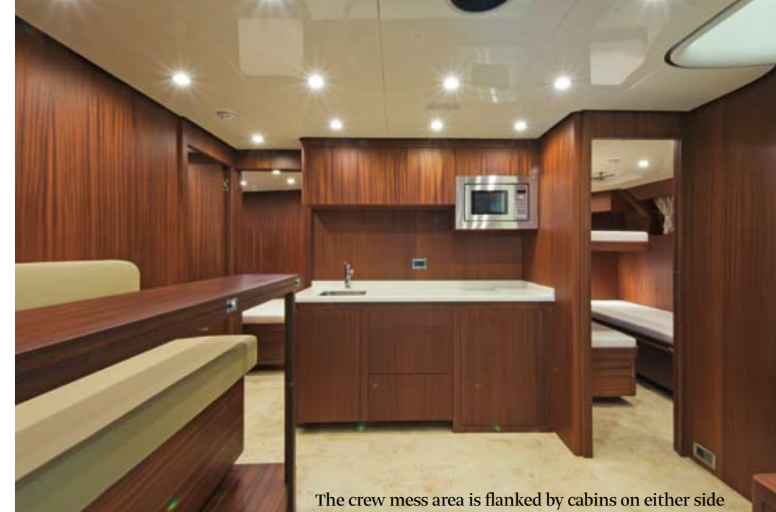
The crew mess area is flanked by cabins on either side

Wide walkways on the main deck take you to the foredeck featuring soft