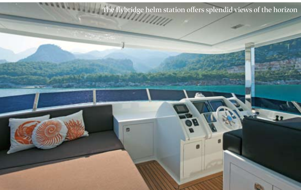
The flybridge helm station offers splendid views of the horizon

provides plenty of shade and covers half of the large sun deck. While it is hugely practical, it does little to add to the impressive exterior styling. If the stanchions had been made of ellipsoid, brushed stainless steel instead of polished box style uprights, we think the overall style of the yacht's exterior would have been enhanced. The sun deck is beautifully laid out in a practical fashion to maximise family enjoyment, and the aesthetics of the stanchion design are easily dismissed when enjoying the amenities the deck offers.