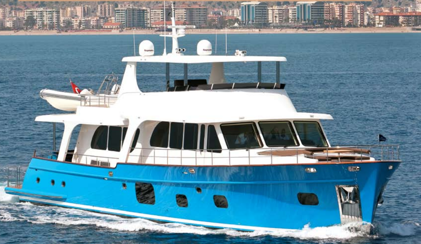
The shiny blue hull gives the design a distinctive appeal

The double cabin located portside has large cupboards and magnificent windows behind the bed. The well-fitted en suite head forward features a large shower and glass cupboards over