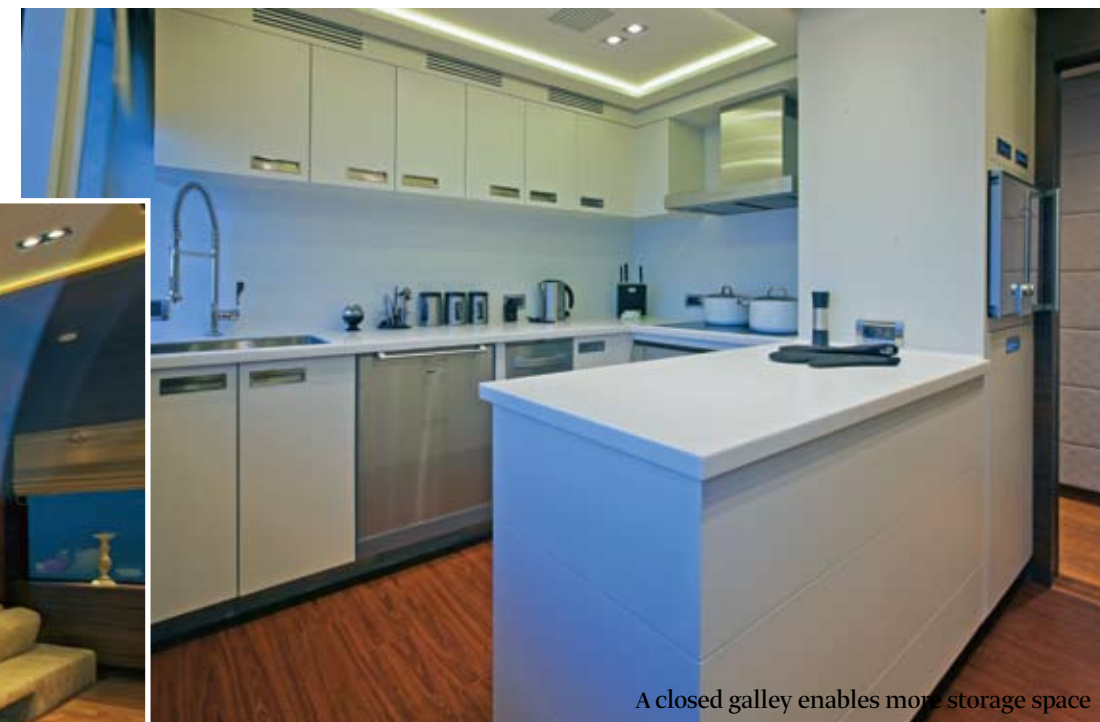
A closed galley enables more storage space