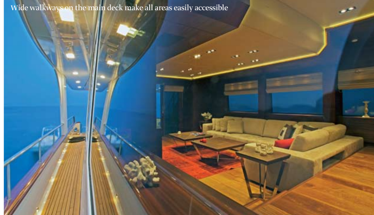
Wide walkways on the main deck make all areas easily accessible

The well-equipped crew quarters are placed aft behind the engine room and are accessed from a door to port. There is also a small galley-cum-mess that opens to the engine room. The captain's double-bed cabin, a crew cabin with bunks for three and a stewardesses'