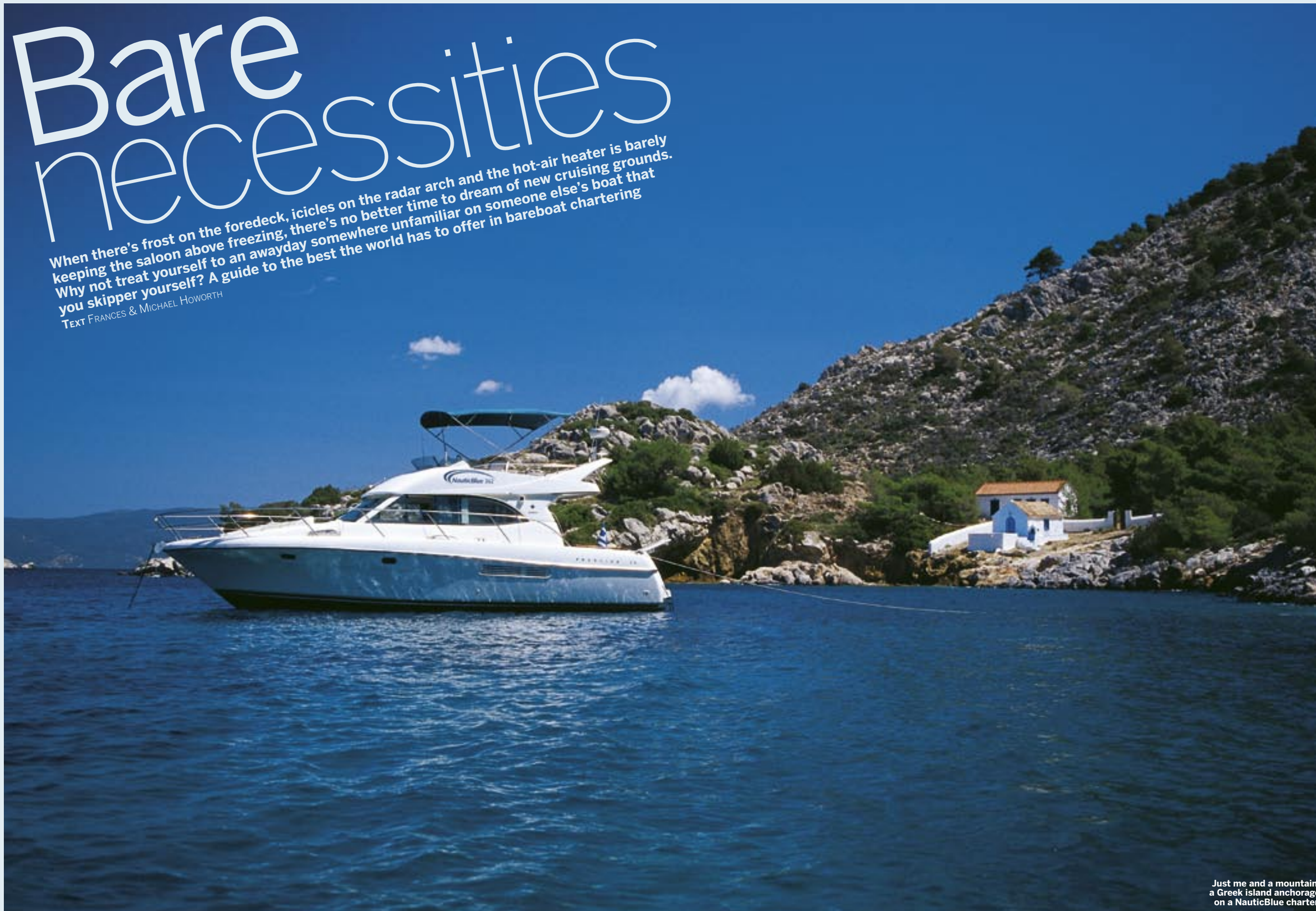
Just me and a mountain: a Greek island anchorage on a NauticBlue charter.

H owever attractive the Solent, the Bristol Channel and the Thames Estuary seem, there comes a time when you fancy a change of seascape, when the chart of your local waters no longer holds the promise of adventure it once did. The blue planet is full of wonderful, sunny cruising grounds that become even more attractive to British boaters as soon as the nights start drawing in. If you want to explore a new spot, or even try out a different type of boat, a bareboat charter is the ideal solution. But where do you start? Due to their higher value and running costs compared to sailing boats, motor boats are more commonly offered for charter with a professional crew on board. But if you want to go it alone, motor boats are available for hire in most of the boating centres – it's just knowing where to look.